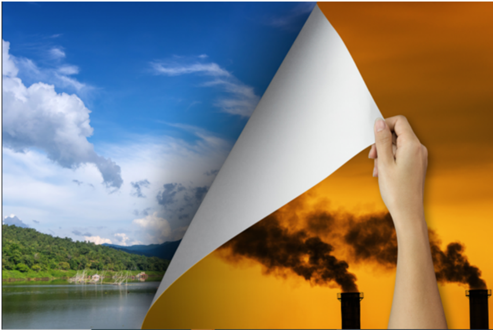
Figure 1. Taking the steps to decarbonize can seem daunting, but the right partner will help identify an individualized path to successful decarbonization.

What if a company could achieve these objectives by making a change to its process heating system? Electrification offers a promising solution.