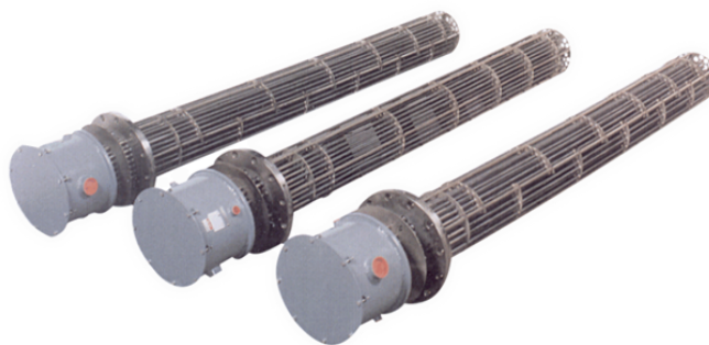
Figure 2. Thermon CX immersion heaters.

Engineered for easy installation, these immersion heaters can be attached directly into existing vessel ports, and come in a variety of standard sizes, and can be made into custom sizes as well. Thermon differs from any electric heater manufacturer globally, by offering third-party validation of the design via HTRI, CFD analysis and scientific testing.